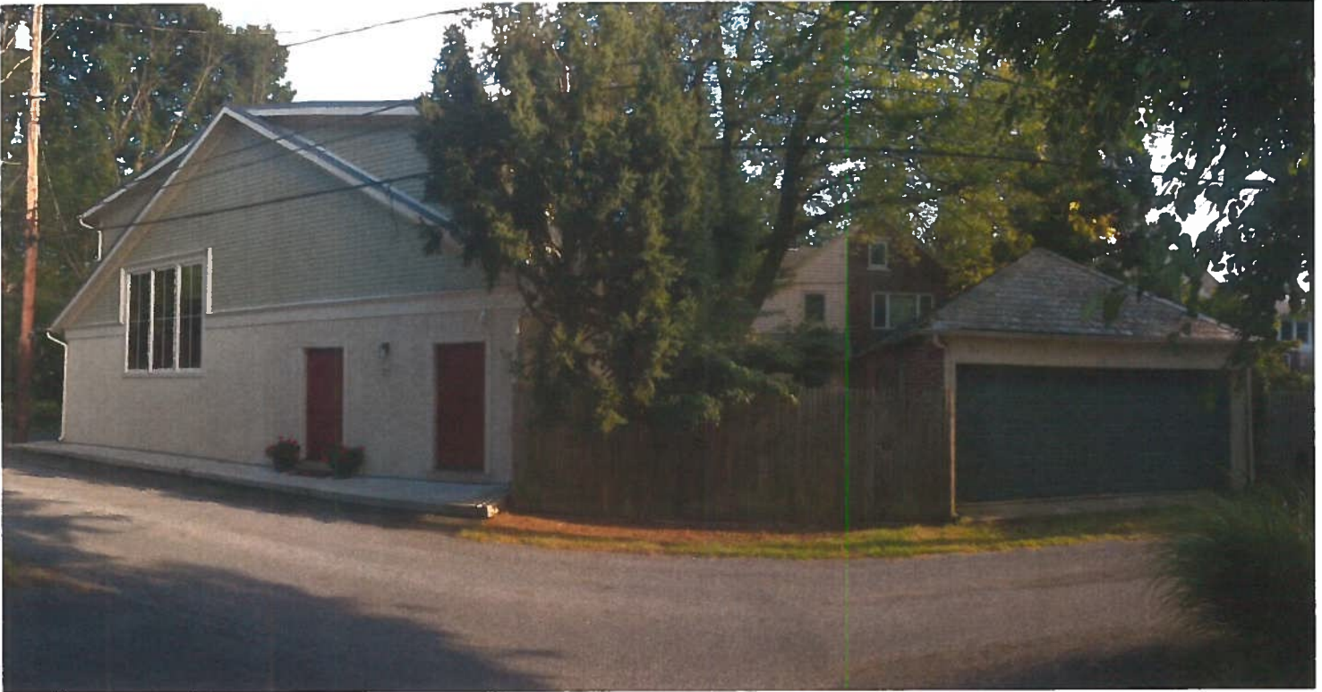
FENCE WILL LOOK LIKE THIS