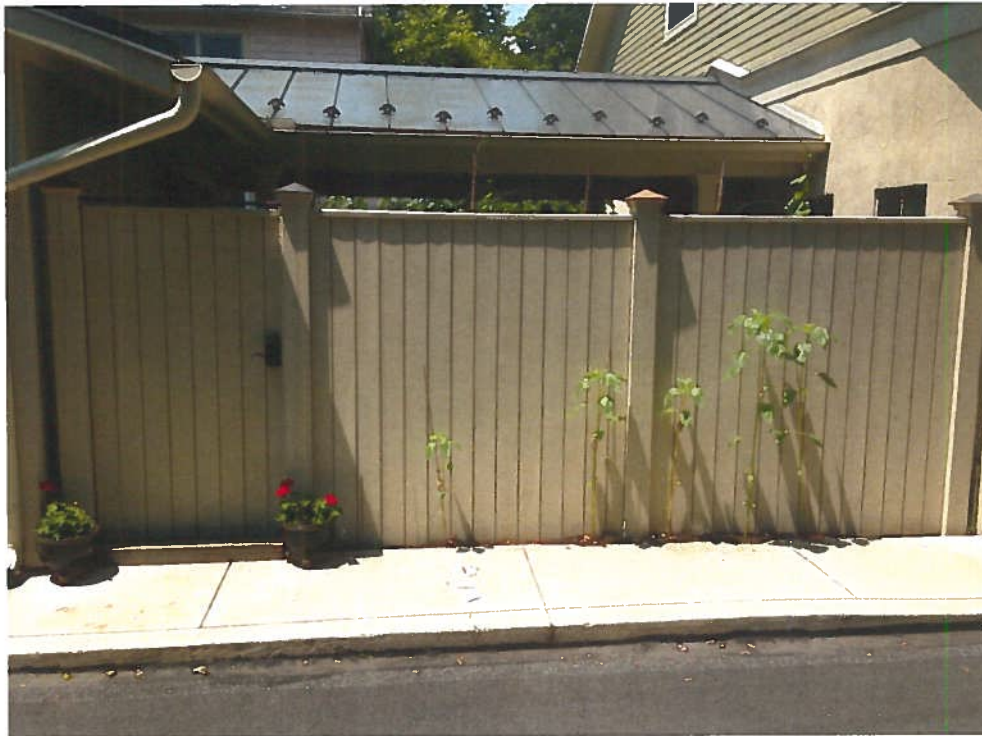
PROPOSED PAINT COLOR